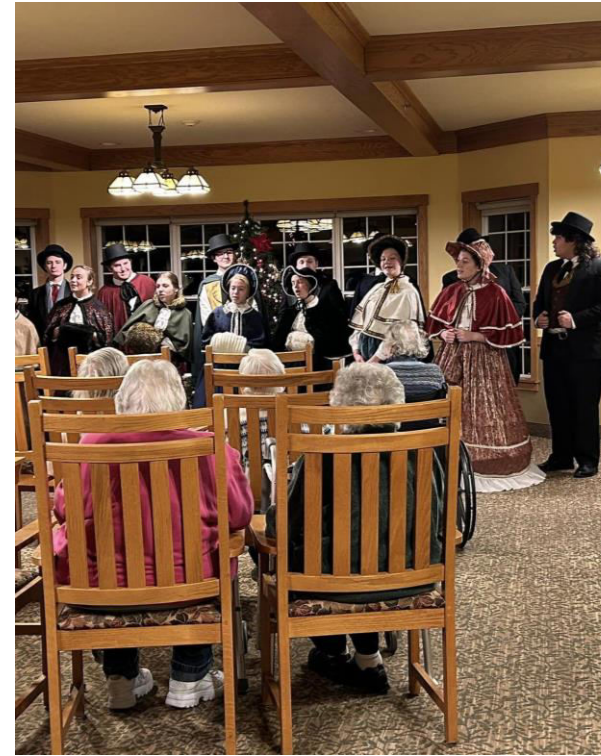
The Union Carolers gave an amazing performance.