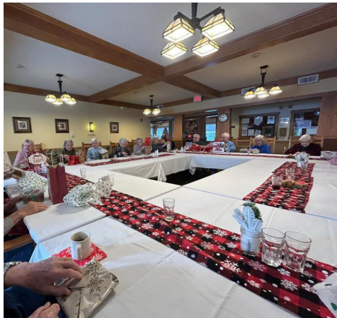
Windsor Manor Resident Christmas Party.