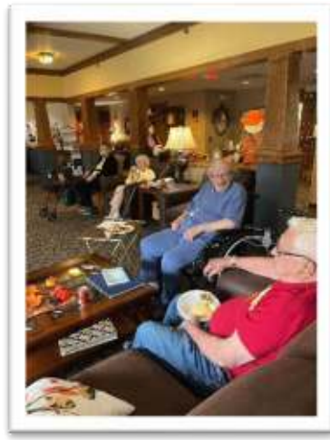
Residents enjoying the Iowa vs Iowa State Party