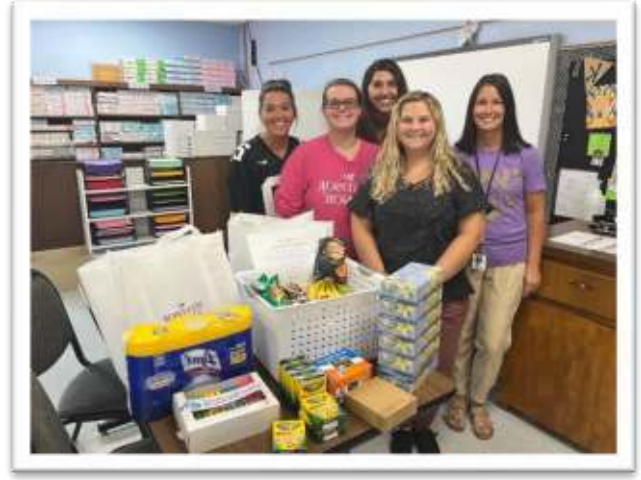
Supplies for schools for Volunteer Wednesday