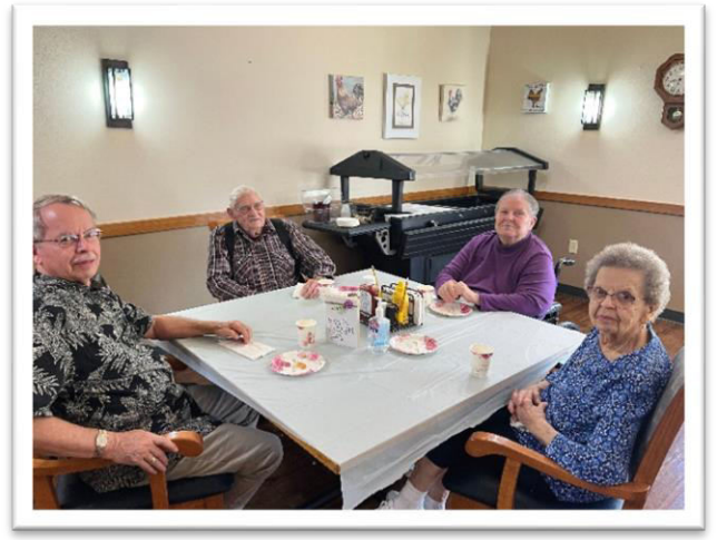
Mother's Day Party